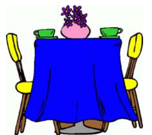
Jan. 31-La Mia Cucina