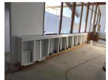
New white shelving under the future Donor Recognition windows.