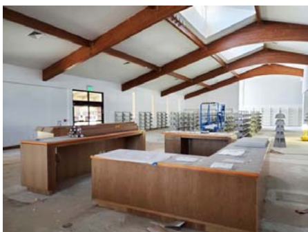
New circulation/reference desk and refurbished shelving. New skylights bring natural light to the main room.

Library's online resources: www.pacificgrovelibrary.org