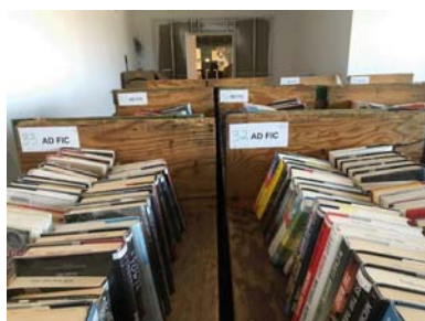
Books at the Holman temporary Library site being prepared for the August move.