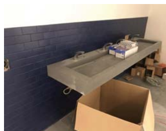
ADA trough-style sink with touchless faucets.