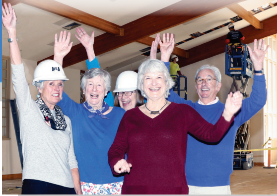
Members of PGPL Foundation Board on Construction Site