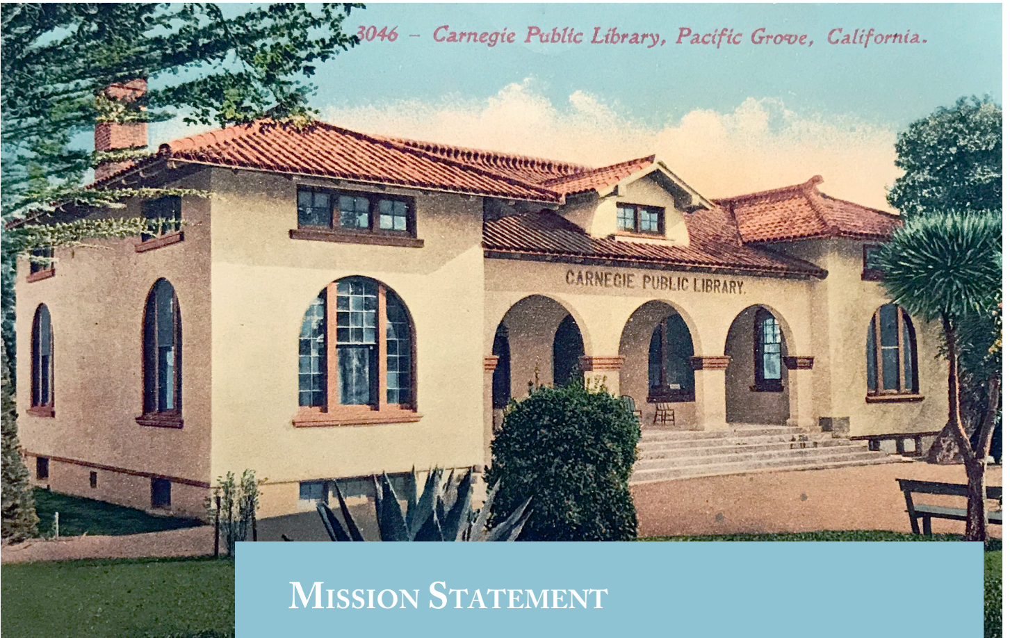
3046 – Carnegie Public Library, Pacific Grove, California.