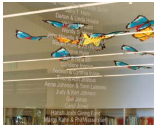
Photos: Library rotunda - a well-known view to Pacific Grove residents Butterfly mobile seen through etched glass with donor names